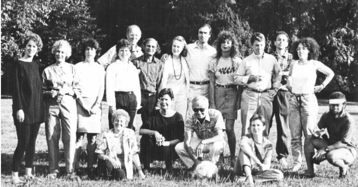
VCCA Fellows in 1987